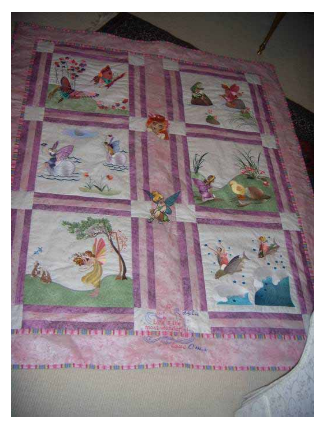
Entry 8 Ylonka van den Boogaard