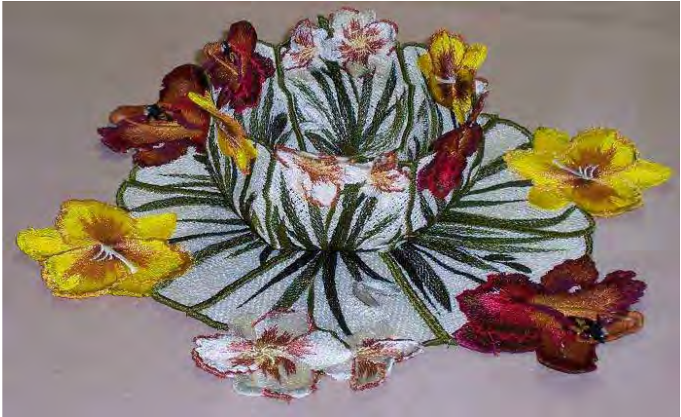
This is done on one layer of WSS, nothing much to say other than it turned out beautiful. The name of the set is BFC280 LACE BOWL AND DOILY –Daylily Garden