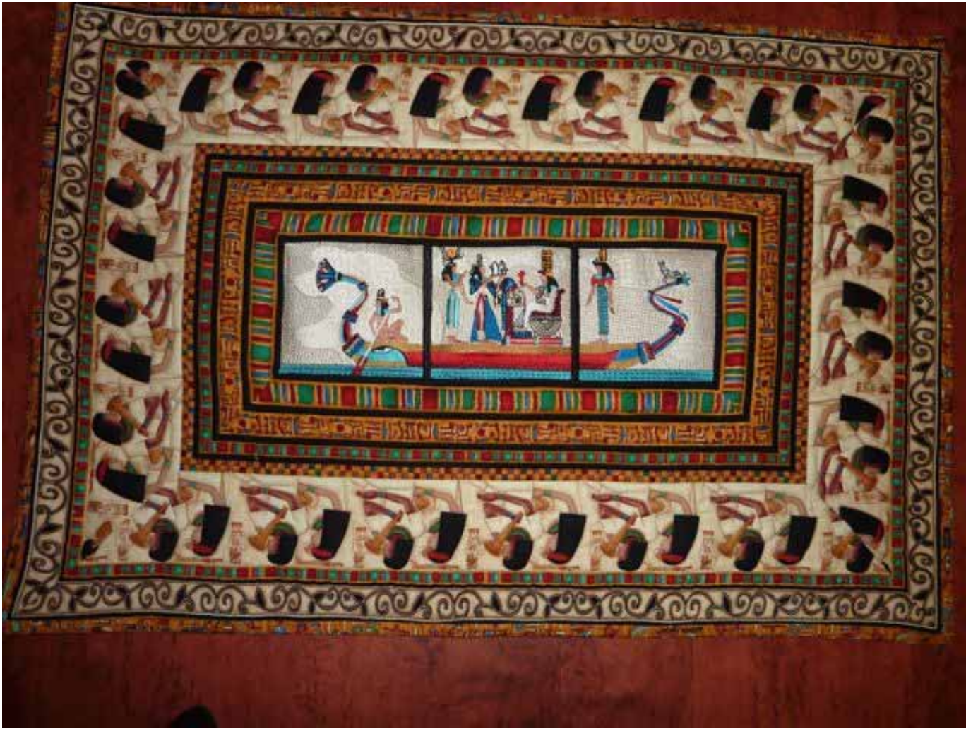
BFC666 – Windows of the World - Egypt.

This was a very large window and I made two embroideries out of it. I made one wall hanging with the Pyramid and the camels and made this table runner with the Egyptians on the Nile.